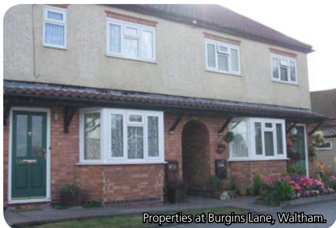
Properties at Burgins Lane, Waltham.

In October we carried out a North Tour of the Borough taking in lots of places including Waltham, Eaton and Stathern. Although we did pick up issues in the areas, the standard of the properties was still very high.