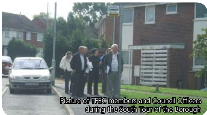
Picture of TFEC members and Council Officers during the South Tour of the Borough

The Tenants Forum Executive Committee carried out a tour of South of the Borough on 30th July 2009. The tour was attended by 9 TFEC members along with officers from MBC and Jeakins Weir. The tour was successful and TFEC got to talk to lots of different tenants.